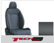
Premium Fabric Seats with Black Interior