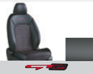
Leatherette Sports Seats with Red Stitching with Black Interior