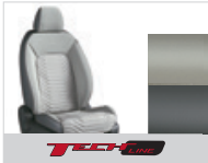
Semi Leatherette Seats with Silver Stitching with Beige and Black Interior